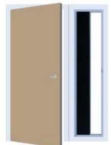
Velo for Sidelites