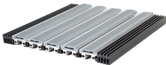
EG601 in Gray

EG610 Alternating: Two types of tread in an alternating pattern provide scraping combined with absorbent carpet for maximum building protection.