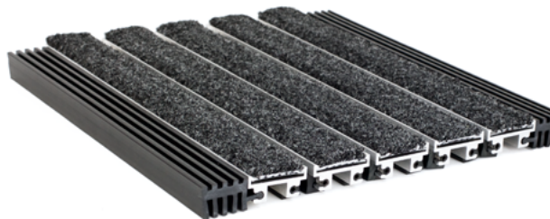
EG600 in Pepper