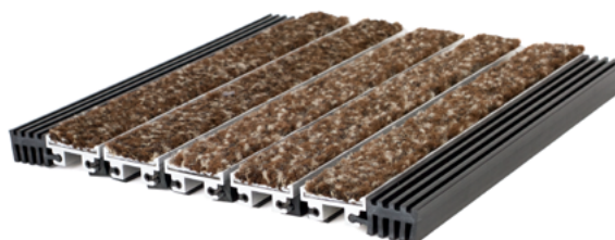
EG605 in Mocha