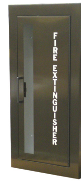
1085 (US10B BRONZE) FINISH & WHITE LETTERING