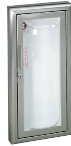
CLEAR VU 1537G25 WITH SAF-T-LOK™