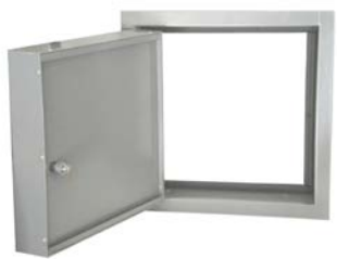
MODEL STC-1212F4 INSULATED AND GASKETED