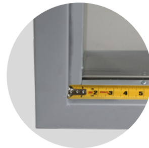
Mounting Option B