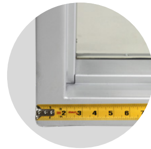
Mounting Option A