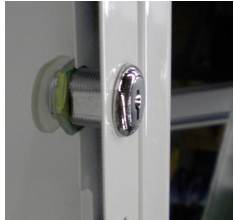
SAF-T-LOK™ In Locked Position