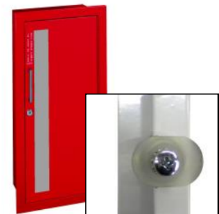
Breakable Plastic Cam

See page 2 for more information on the SAF-T-LOK™