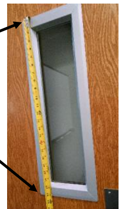
Measure to Outside of Vision Lite Frame Example Shown is 27 3/8" H