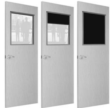
3M Dual Lock® Attachment to Vision Lite