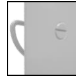
Standard Cam Latch