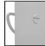
Standard Cam Latch

Order Format Example: TM-2424C W TM - _____ Width Height Lock (C Std or Option Code) Special Finish