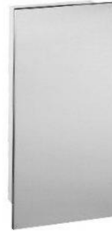
5634S21 Stainless Steel