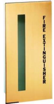
5654V10 Brass With Concealed Pull