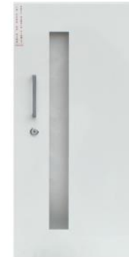
5614W10 Steel with Pull Handle and Saf-T-Lock