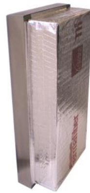
New Lighter, FX2 Insulation