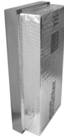
New Lighter, FX2 Insulation