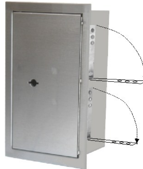
Extend masonry anchors provided, for installation in new masonry construction.