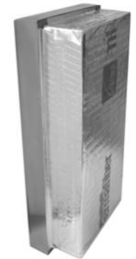
New Lighter, FX2 Insulation