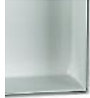
Recessed Door Accepts 1/2" Insert