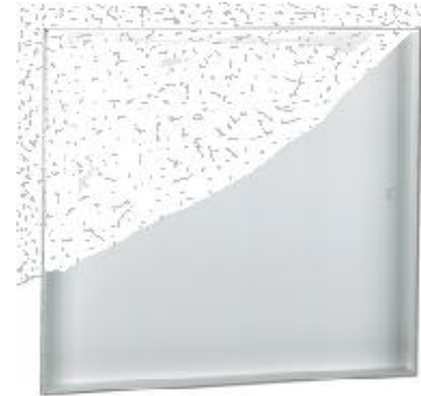
Panel shown as partially-covered by acoustic tile

Sizes: Minimum 6" x 6". Maximum walls—36" x 36", ceilings—24" x 48"