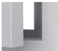
Optional Smoke Gasketing

Available at an additional cost. Optional for all models except FD2RF, FD2CT, FD2L, FD3RF, and FD3HT2.