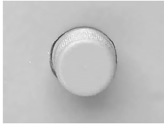
KK Optional Knurled Knob Operator

Provided standard on all FD2 and FD3 models at no charge, except FD2L.