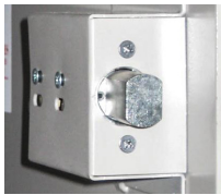
MP Optional 1-1/8" Morise Lock Prep

Available at an additional cost. Optional for all models except FD2CI, FD2WI, FD2CT, FD2L, and FD3CI.