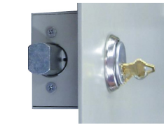
MPI Optional 1-1/8" Morise Prep with Lock Installed

Available at an additional cost. Optional for all models except FD2RF, FD2CT, FD2L, and FD3RF. Lock by others.