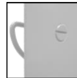
Standard Cam Latch