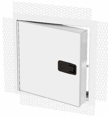
XTEA with Standard Latch

Select this exterior access panel design with energy efficiency in mind. 2 inches of polyisocyanurate provides an R-value of 13, and dual layered gasketing provides the weather-resistance you need. Door opens to 170°.