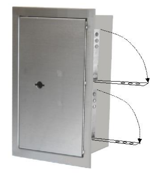
Extend masonry anchors provided, for installation in new masonry construction.