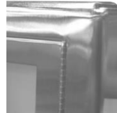
#7 Polished Finish