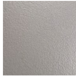
Silver | SI