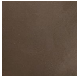
Bronze | B

This method yields a continuous coat of paint both inside and outside of the part providing excellent protection against moisture and dust, giving your product the longest lifespan possible.