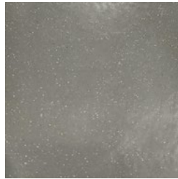
Gray | G