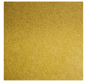
Brass | BA