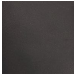
Flat Black | FB