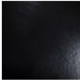
Black | BK