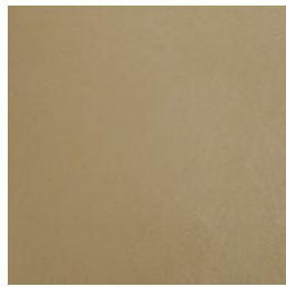
AMS Beige | AB