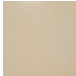
Sand | S