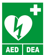
14S-ILCOR - Tent Bilingual Wall Sign 6" x 4 1/2"