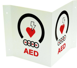
14TS - Tent Wall Sign 7" x 6" x 4.5" - .020 White Styrene