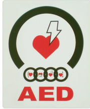
14S - Flat Wall Sign 8" x 11" - .020 White Styrene

These Durable Signs are Screen Printed with High Quality Graphics to draw Visibility to the AED Emergency Station. All are Easily Mounted to the Wall Using Screws.