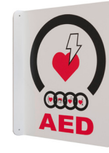
14XS - Right Angle Wall Sign 8" x 11" - 1/8" PVC Printed 2 Sides