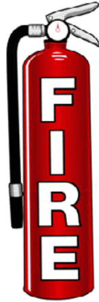
CL-401 Decal available with red or white background