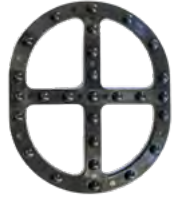
10300 - Fire Extinguisher Rust Prevention Tray Accessory