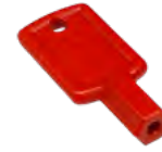
10006R - Red Hex Key Also available in white 10006W Installed key matches trim color