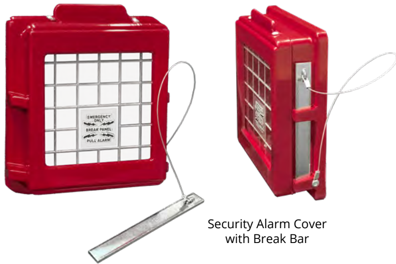
Security Alarm Cover with Break Bar

Cato's quality protective alarm covers, manufactured in the U.S., provides a dent and rust proof alternative to metal. The protective alarm cover with the security cover is vandal resistant and contains a side slot to hold the break bar in place when not in use. It arrives fully assembled and is quick to install.