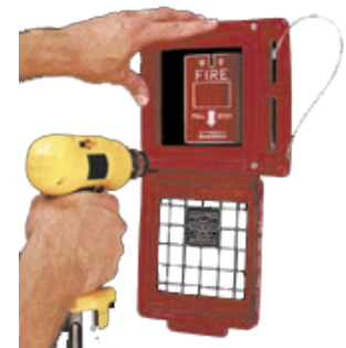
Figure 4: Securing Alarm Cover to Wall