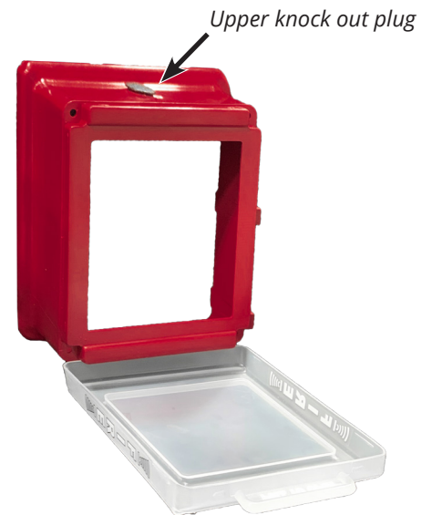
Figure 2: Pull Down Cover