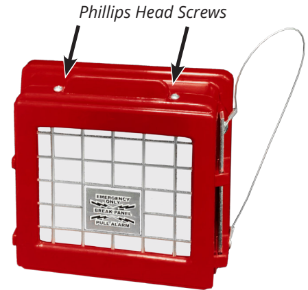
Figure 1: Cato Security Alarm Cover