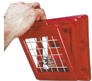
Figure 2: Pull Down Cover