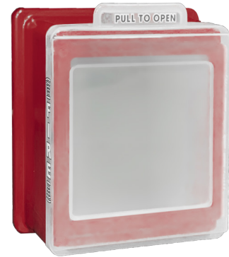
Figure 1: Cato Pull to Open Alarm Cover