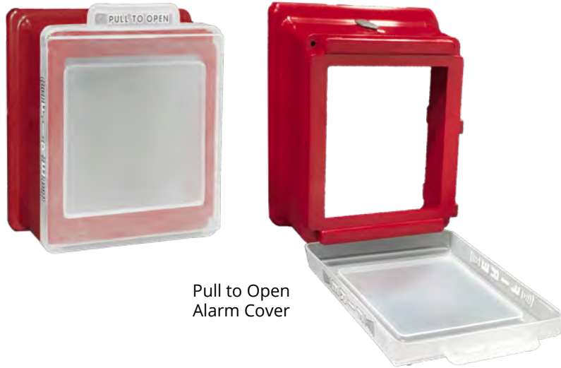
Pull to Open Alarm Cover

Cato's quality protective alarm covers, manufactured in the U.S., provides a dent and rust proof alternative to metal. It arrives fully assembled, quick to install, the cover can be opened quickly in case of emergency and remains open during inspection and maintenance.