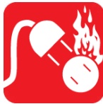
CLASS C FIRES Energized Electrical Equipment

Hand portable extinguishers containing FK-5-1-12 clean agent.