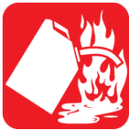
CLASS B FIRES Flammable Liquids and Gases