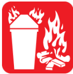
CLASS A FIRES † Common Combustibles