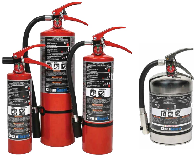
FCGP03 FCGP13 FCGP07 FCGP14-NM

Typical applications for the CleanGuard+ are computer centers, data/document and art storage rooms, communications facilities, laboratories and sensitive equipment.