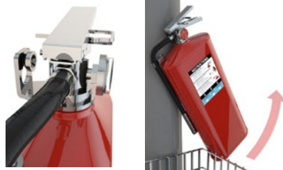
Button Hook for FE10VB & FPK10VB

CLASS C FIRES Energized Electrical Equipment