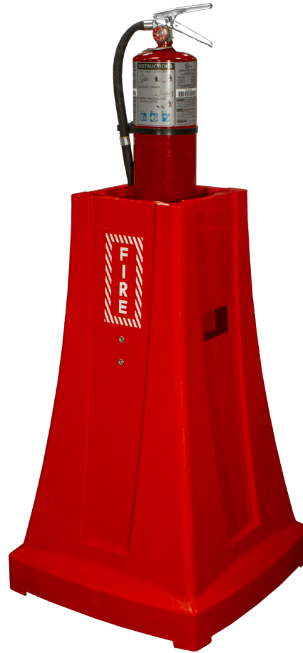
FES5 Stand shown with Fire Extinguisher (sold separately)