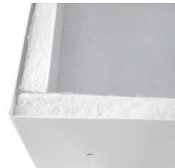
Detail of Double Tub with Insulating Gypsum

FIRE-FX fire-rated cabinet design is used for Security and Detention Cabinets as well as the School Series Cabinets