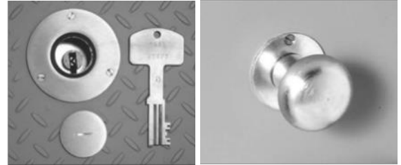
Detention Lock Topside with Operable Knob Underside