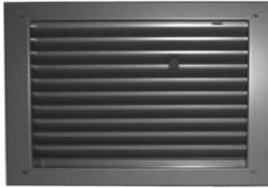
1100A Photo & Drawing

Manually-Operated Adjustable Louver for Doors, Transoms and Partitions