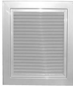
1300A1 Photo & Drawing

Inverted "V" With 60% Free Area Recommended for Buildings Where All-Aluminum Construction is Desired, or for Humid Environments