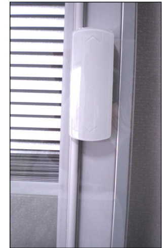
Dual Operator: Lift & Tilt