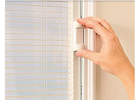
Slide to Raise/Lower & Tilt for Single Control

All models have a Single Fingertip Raise, Lower and Tilt Controller which slides up and down on the edge of the unit. Operator mounts to internal mechanism magnetically.