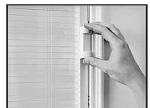
Slide to raise/lower and tilt for single control of the blinds