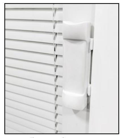
Tilt Control Operator This Will Lift and Tilt