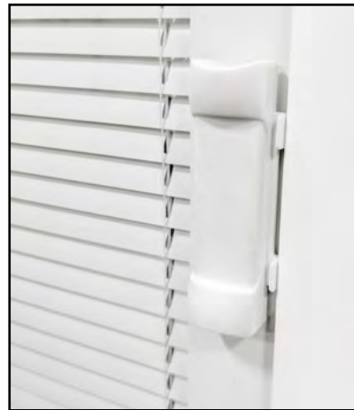
Tilt Control Operator This Will Lift and Tilt