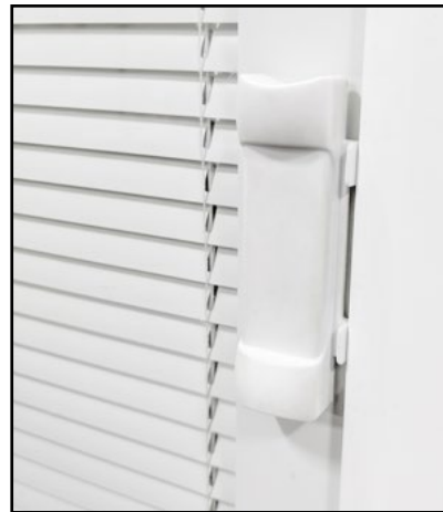
Tilt Control Operator This Will Lift and Tilt