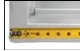
Measure outside dimensions of existing sidelite frame.