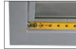
Measure inside dimension. Subtract 1/2"