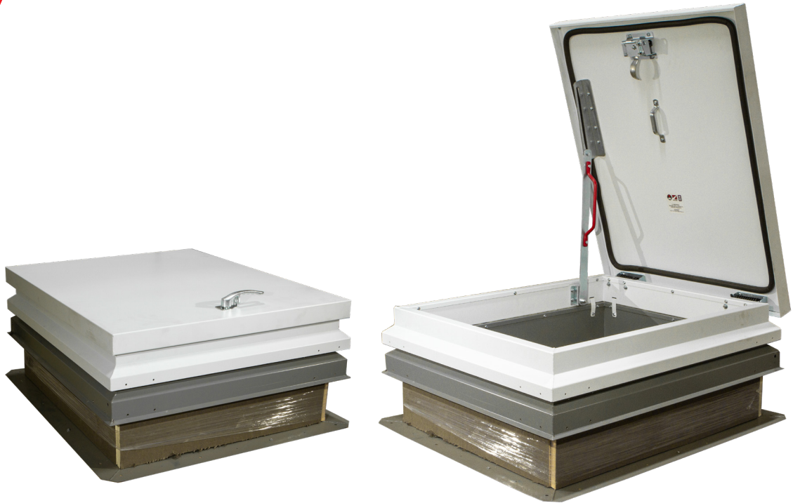
RHRM (Mounted on existing curb)

The RetroMount series roof hatch is a low-profile replacement option for a damaged roof hatch. You remove the existing hatch cover and reuse the existing curb. The RetroMount hatch installs directly onto the existing curb. This alleviates the need to do any re-roofing around the hatch itself. This unit is available in several standard sizes and custom sizes upon request.