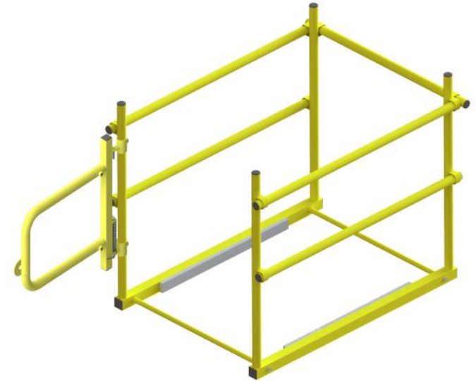
Gate Installed on SHWC 3036 Safety Railing (Railing Sold Separately)

Note: Saf-T-Hatch™ Safety Railing sold separately from gate. See separate submittal.