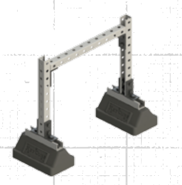
Multipurpose Single Series Model - RKCMA1