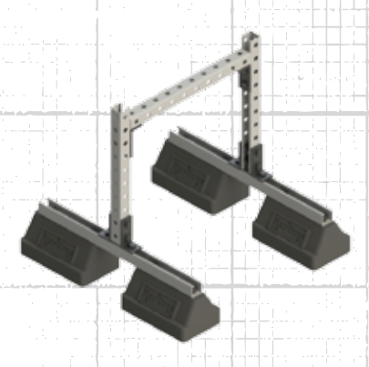
Multipurpose Dual Series Model - RKCMA2