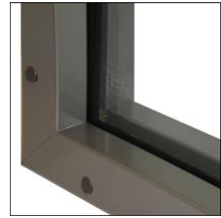
Leadlining Shown Below in Yellow