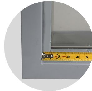
Mounting Option B