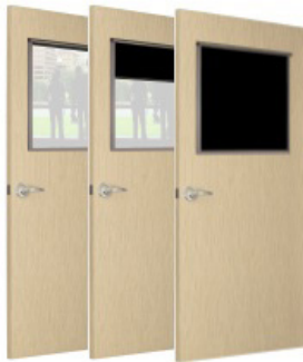
Velo for Doors

Ultimately, the district used general fund dollars to purchase 116 privacy screens, and finalized all of their upgrades within 18 months. Compared to other options, the privacy screen was more cost-effective and provided the best vision blocking into rooms.