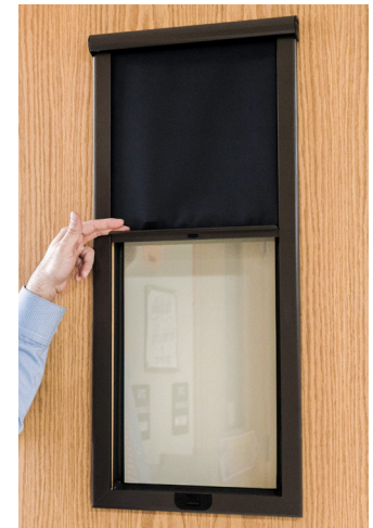
Velo Privacy Screen Pulls Down with One Hand

They found that the pull-down privacy screen from Air Louvers met all of those needs. The screens which block all light and vision, have been added to classroom doors and incorporated into the new lockdown procedures.